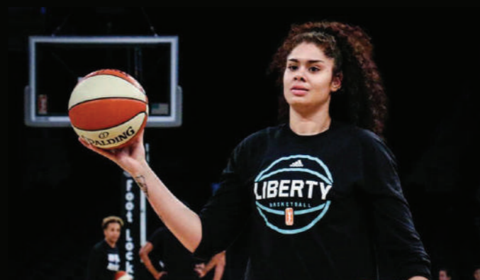
Amanda Zahui B. New York Liberty, WNBA "I am using padded compression wear to keep my body solid and protect from hits and falls. I think it is very important since basketball is very physical contact sport, a lot of bodies are being thrown around, so to save ourselves from bad hits we should protect us with protective gear."