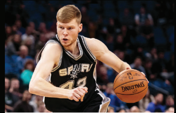
Davis Bertans San Antonio "Spurs", NBA "I did not use protective gear before because it made me feel big and uncomfortable. Everything changed when I tried out BLINDSAVE protective gear. It was so comfortable I didn't feel that I had any protectors on me."